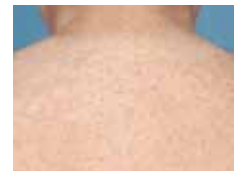
6 weeks post 5 treatments