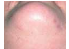
Post 5 treatments