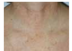
One month post 1 treatment