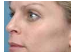
Post 5 treatments