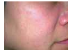
Post 1 treatment